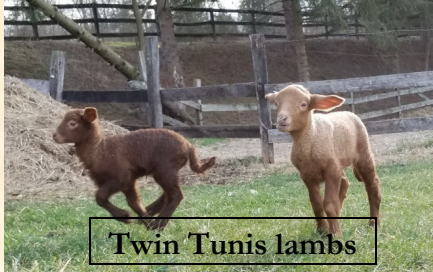
Twin Tunis lambs

By Kim Day from an article found at: http://redropefarm.com/2017/04/26/color-changing-lambs