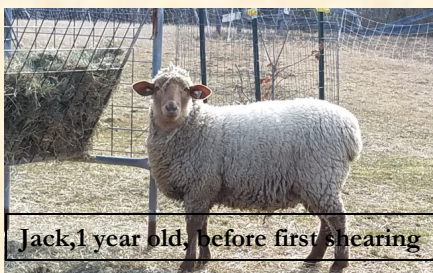
Jack, 1 year old, before first shearing

You can see this in the photo of a 6 week old lamb. The kemp fibers are longer and becoming more sparse overall.