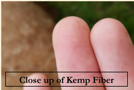
Close up of Kemp Fiber

Tunis lambs are born with a short layer of cream-colored wool over their torsos and necks and light to dark cinnamon colored hair on their legs, heads and tails. Intermixed in the wool are longer kemp fibers (think guard hairs) that can sometimes completely hide the wool. The amount of kemp fibers can vary between lambs, just as the cinnamon shade can. To the left are twin lambs. Notice how one is much darker and also has more kemp fibers covering his wool.