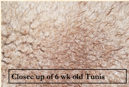
Close up of 6 wk old Tunis

I'm often asked about Tunis wool. Is it soft? What projects are it good for? Why do lambs have different colored wool than adults? Tunis wool is a fine to medium, down-type wool with lots of loft. If you're not familiar with wool or fiber terms this means Tunis wool is soft and bouncy and makes light and springy yarn which is great for a variety of projects. Explaining the lambs' coloring isn't as simple.