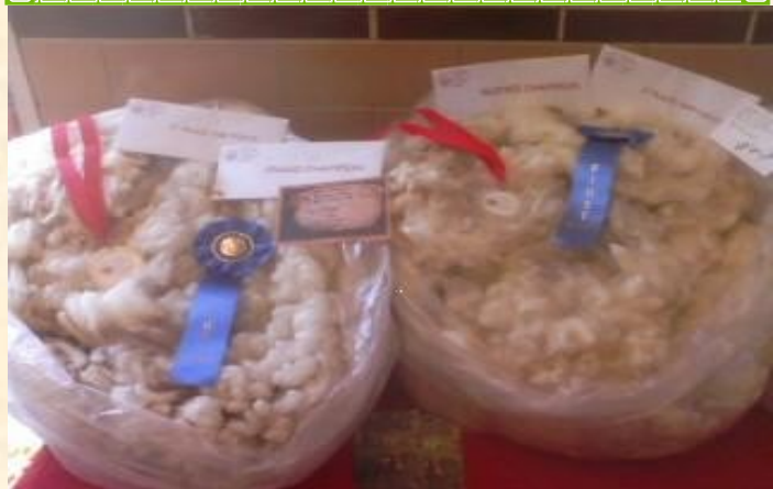
Grand Champion and Reserve Champion Fleeces from the National Wool Show in Wooster, Ohio.

KILE is just around the corner and there will be a ewe sale on Saturday, Oct 4th at 5 PM. Hope to see some of you there.